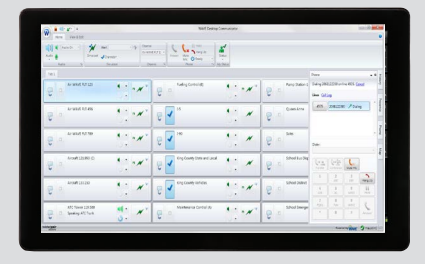
Give authorized PC users controlled access to MOTOTRBO communications channels with the WAVE Desktop Communicator.