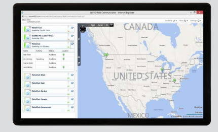
With WAVE Web Communicator you can use a web browser to access your MOTOTRBO radio channels.